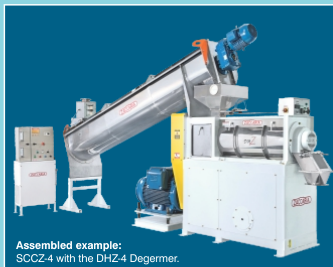
Assembled example: SCCZ-4 with the DHZ-4 Degermer.

A = 2515 A = 2840 A = 3502 A = 3975 B = 1470 B = 1670 B = 2070 B = 2290 C = 1085 C = 1235 C = 1360 C = 1435 D = 640 D = 740 D = 889 D = 1050