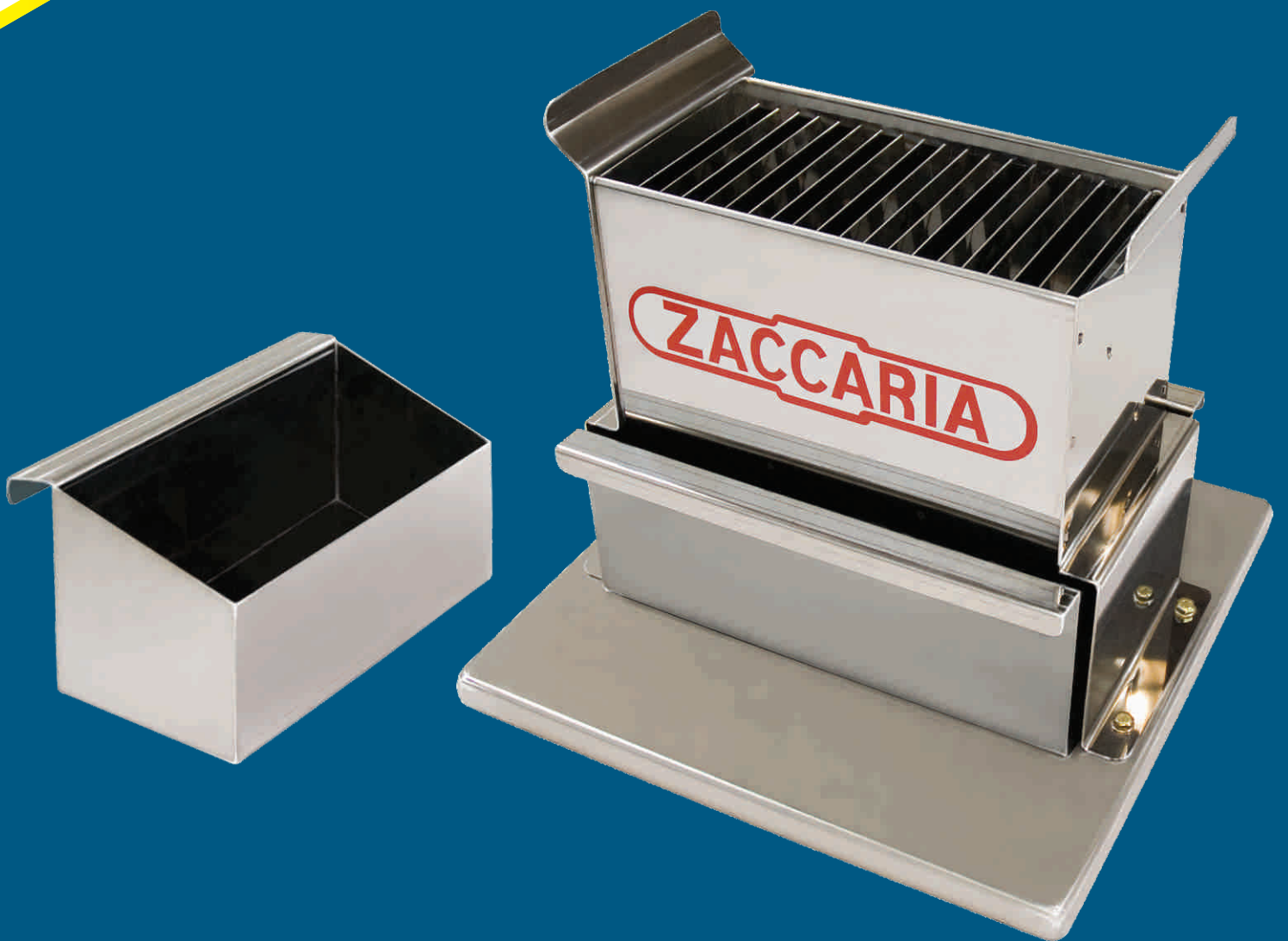
Sample Splitter QAZ-1