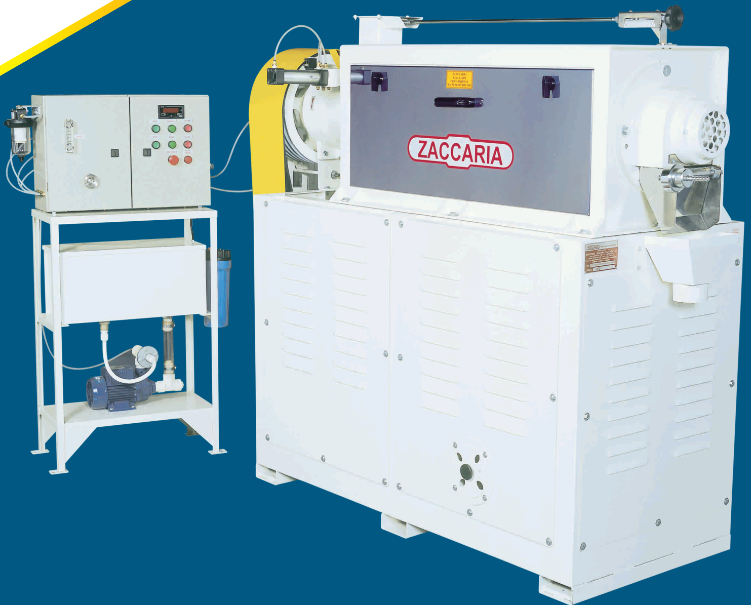
Water Polisher WPZ-1