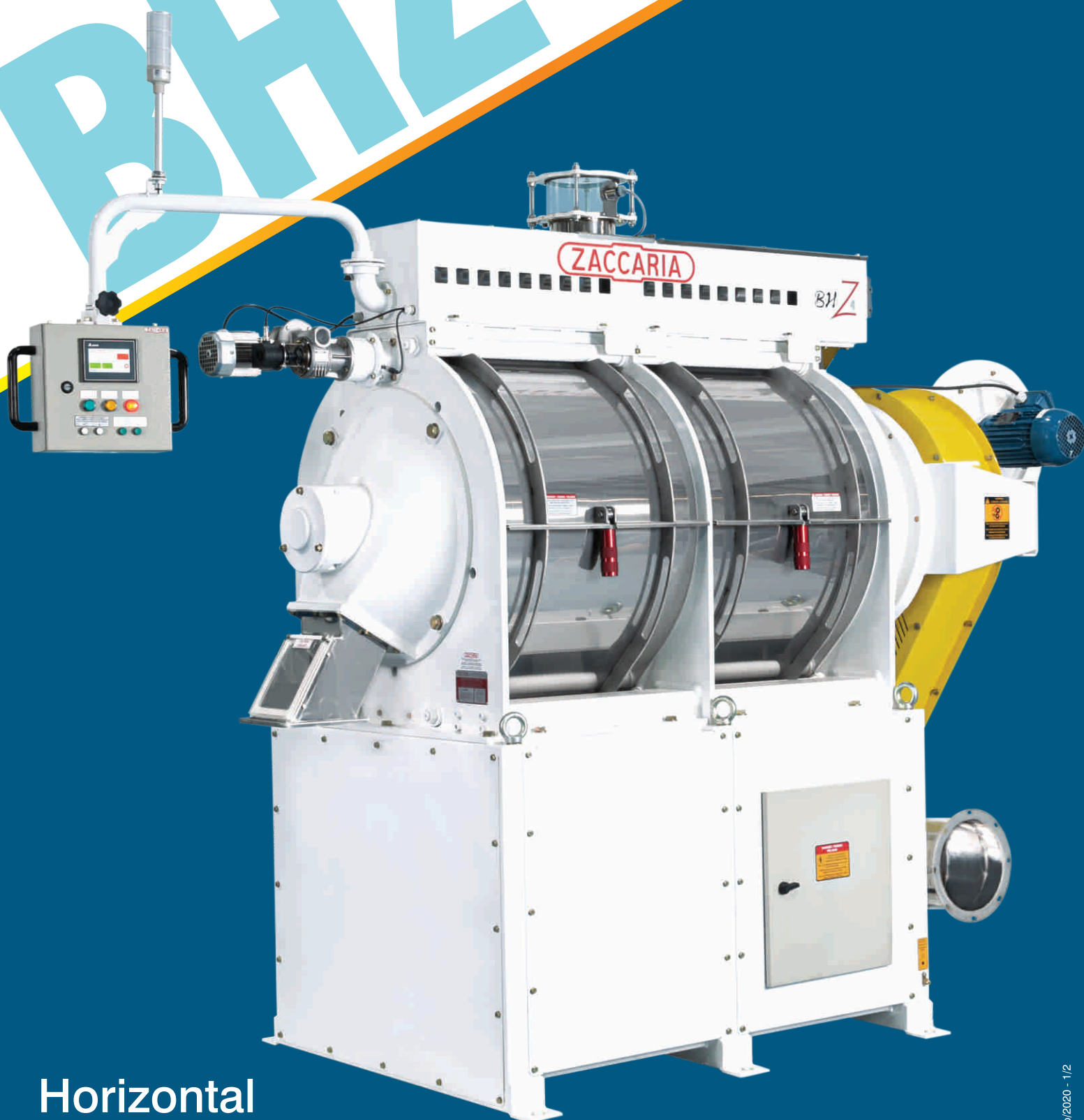
Horizontal Rice Whitening Machine BHZ-4