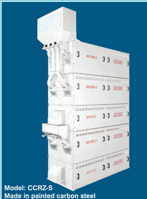
Model: CCRZ-S Made in painted carbon steel