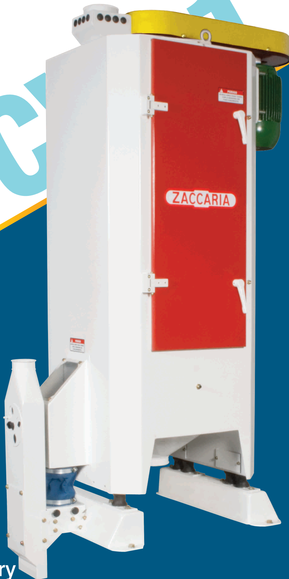
Vibratory Centrifugal Sieve for Bran PCVZ-1