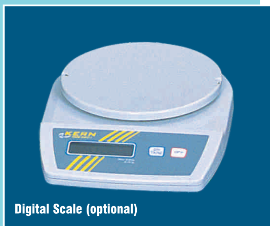
Digital Scale (optional)