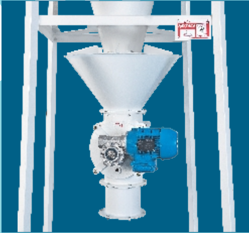
*Note: Photo showing detail and illustrative drawings refer to model EFZ-2R.

The set offer high efficiency with low maintenance.